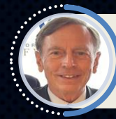
GEN. (Ret.) David Petraeus Executive Chairman, NYC Chapter, CFF PAC